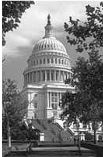
Mustangs at top of their game in Washington, DC

All local conference fees are included in your one time Participation Fee.